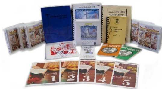
Diploma of Biblical Studies

If the student chooses to pay in payments, this program will cost a total of $850.00, plus shipping, unless the courses are taken one at a time (which will cost extra). If you audit this program, it will cost $600.00. If you pay the bill in full initially, it will only cost you a total of $800.00. Including the 16-credit hour tuition!