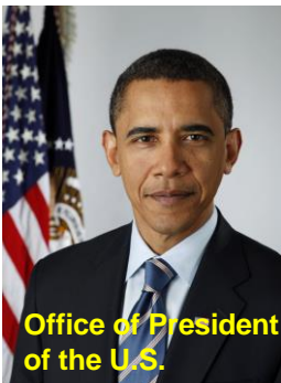
Office of President of the U.S.