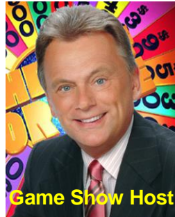
Game Show Host