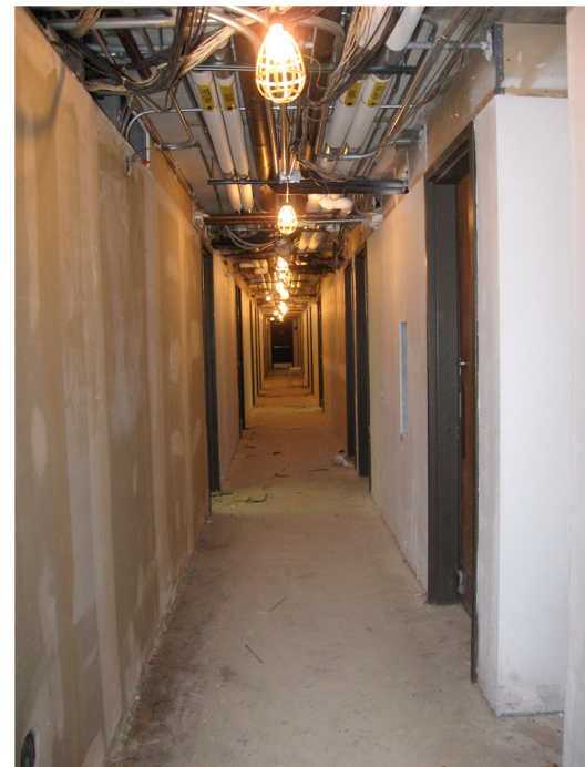
Resident Hall #1 - Picture as of October 18 th , 2011